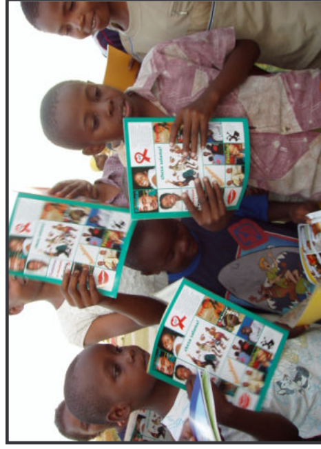
Outreach campaign by SYDP at Mandela Ground reaching in and out of school youth h.